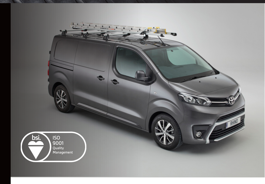
Next Generation Roof Racks, Bars & Accessories

With over 15 years' experience in manufacturing & producing commercial vehicle accessories, Rhino can confidently claim to deliver exactly what the end user is looking for to make their job easier. Rhino meets the global demand for products by utilising both the local & global supply chain to procure the best components to meet their specifications for building the toughest of products and meet the demands of the professional trades person.